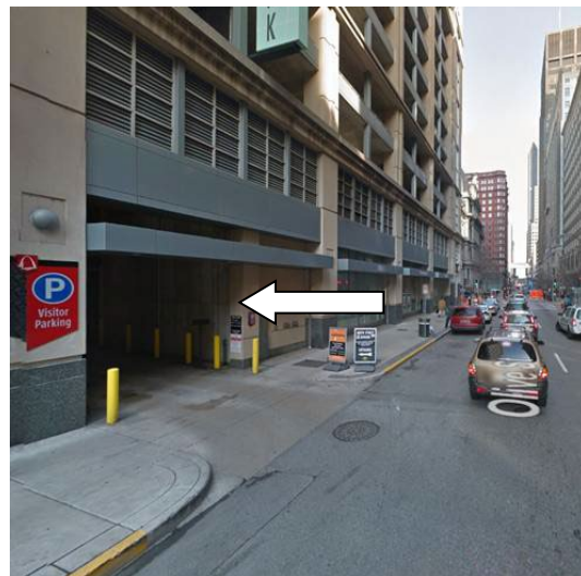
Entrance to garage on Olive.